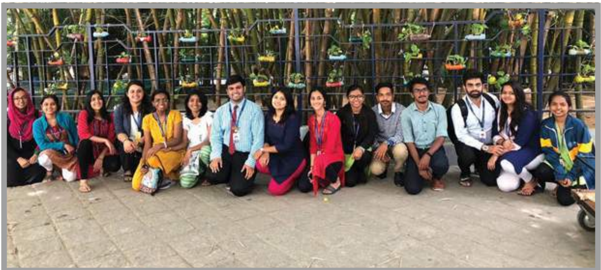
Volunteers - SAFE Club

In association with Cognito, SAFE Club organized a day that was dedicated to raising our voice for the voiceless. The students of the entire department were instructed to wear red, as a representation of the plight that animals go through in different industries that use them for human greed. The entire department was decorated with posters about animal rights. The students were also given petitions to sign, which was sent to the office of Maneka Gandhi via the organization- "Voiceless India".