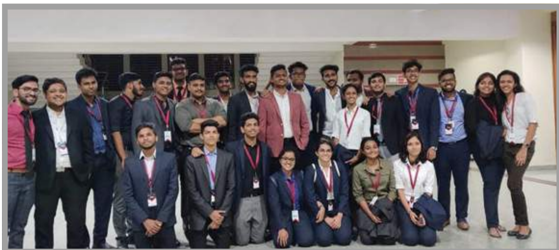
The Organising Committee

Christ Bannerghatta Campus have won the overall trophy for this edition of Future MUN.