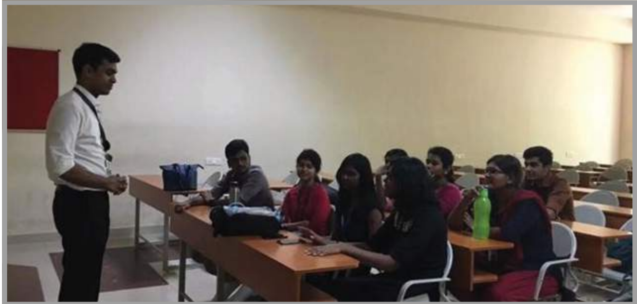
Students involved in discussions with the Kannada Nudi Trainer