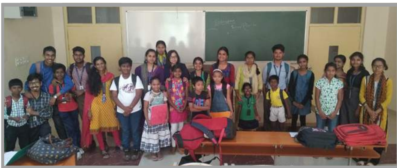
Saturday evening with the kids