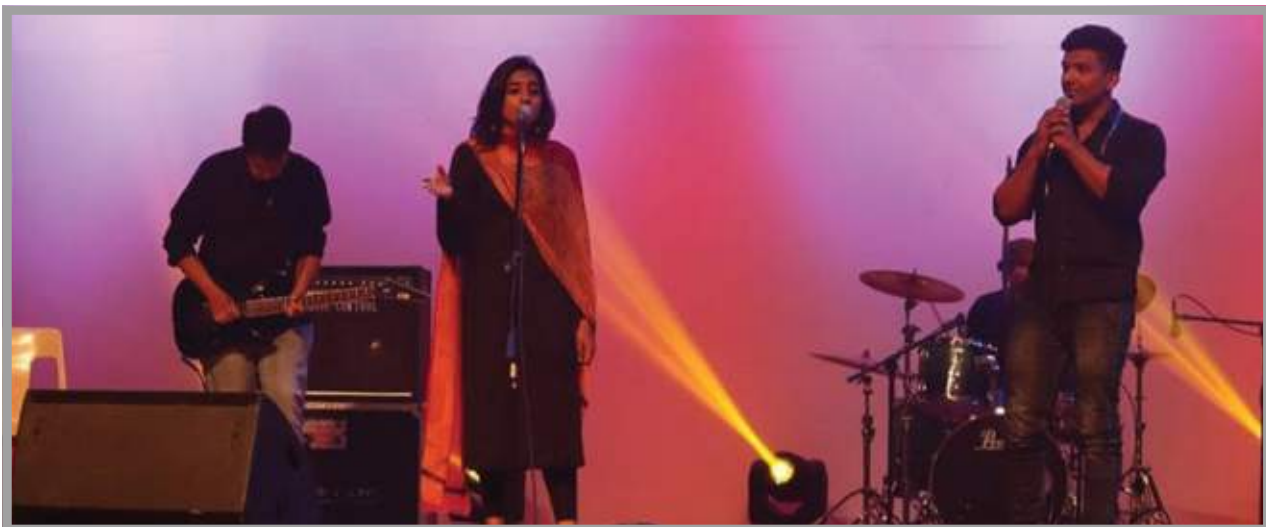
MUSICAL PERFORMANCE - TEAM VIHAR