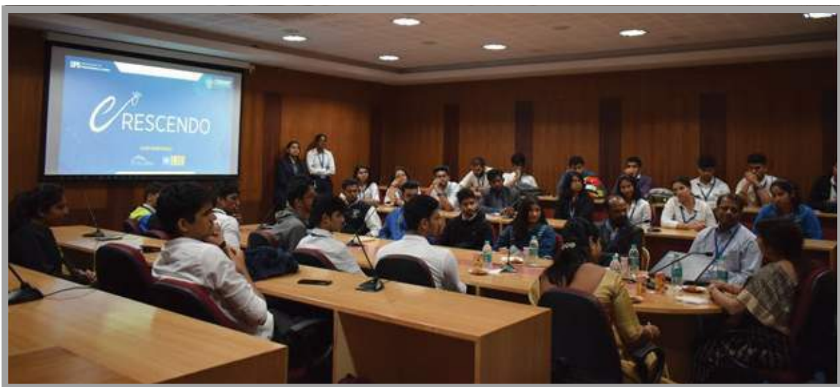
Panel Discussion- Crescendo