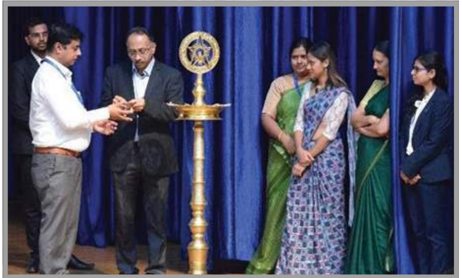
Lighting of the lamp by the dignitaries