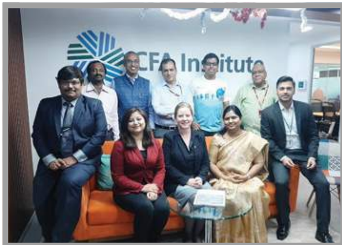
Rondtable conference of CFA Institute, Mumbai