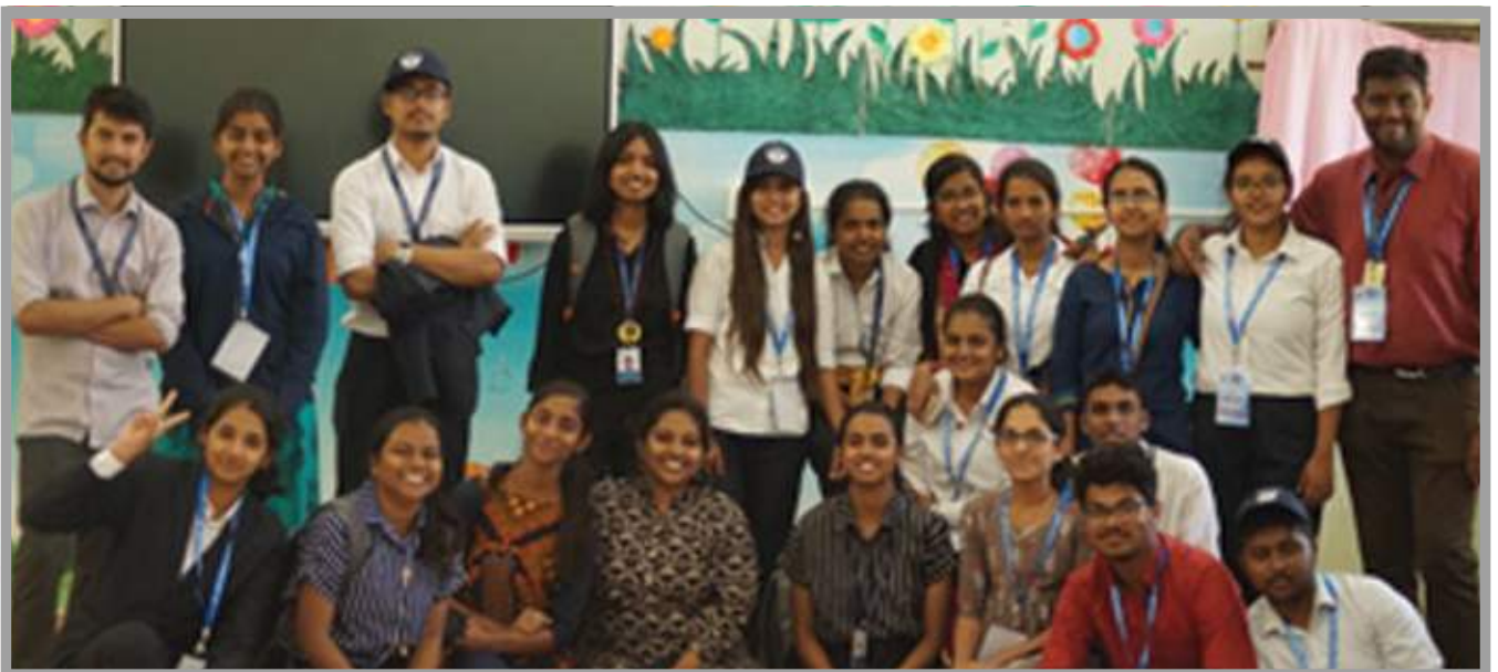
The Sahyog team that visited Christ Special School for Annual Sports Day 2020

A Sign Language Class was organized by Enable India in the Seminar Hall as part of Sahyog where students were taught on the usage of Sign Language.