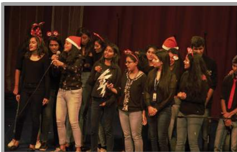
3rd Year BCom F&A