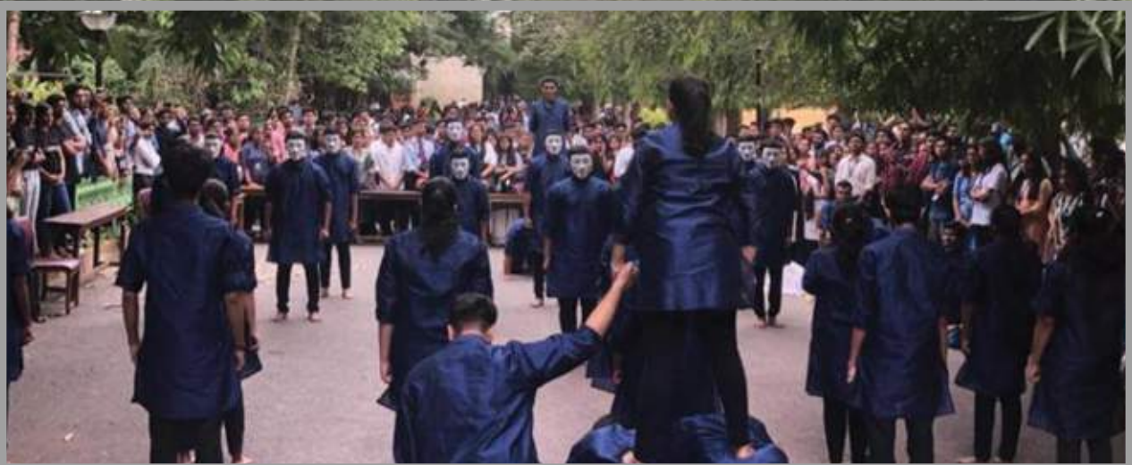
STREET PLAY- TEAM PROFESSIONALS

Our Department saw 35% of its representation in the theatre part of the University Cultural Team. There were also students representing our department in the University Cultural Team in different events such as dance, music and quiz.