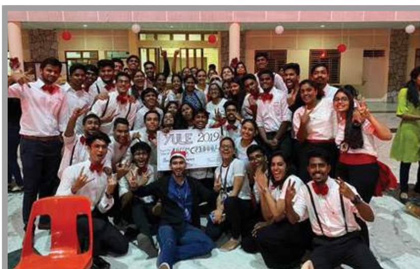
Winners Dance and Best Costume Competition- 2nd Year BCom F&A