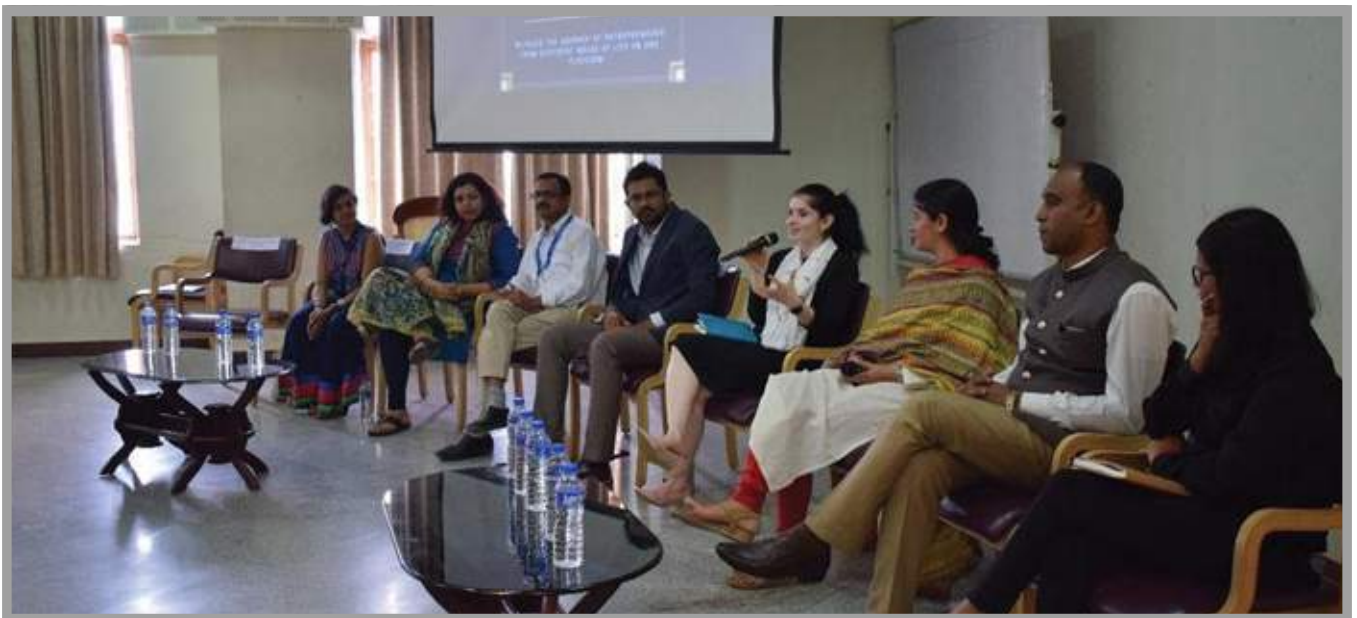
Panellists - Unravel 2019