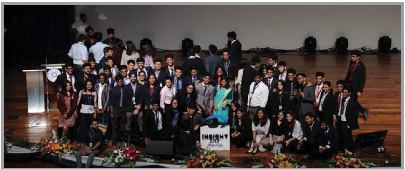
Organizing committee- Insight

This year's event was sponsored by Zee Loft (title sponsor) and Bounce (beverage partner) who made it possible to hold this event on the scale and level, much higher than the past years.