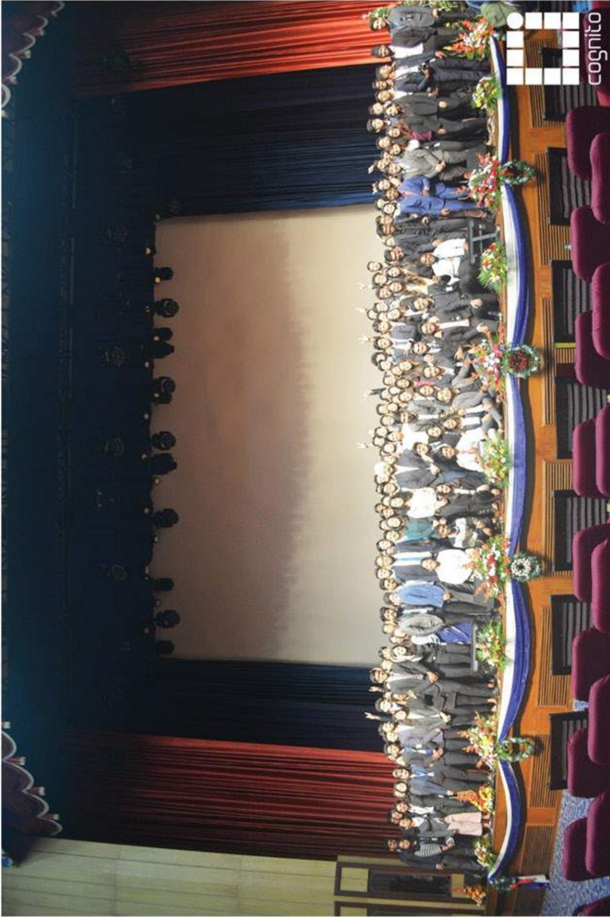
The Organising committee of Cognito Aviation