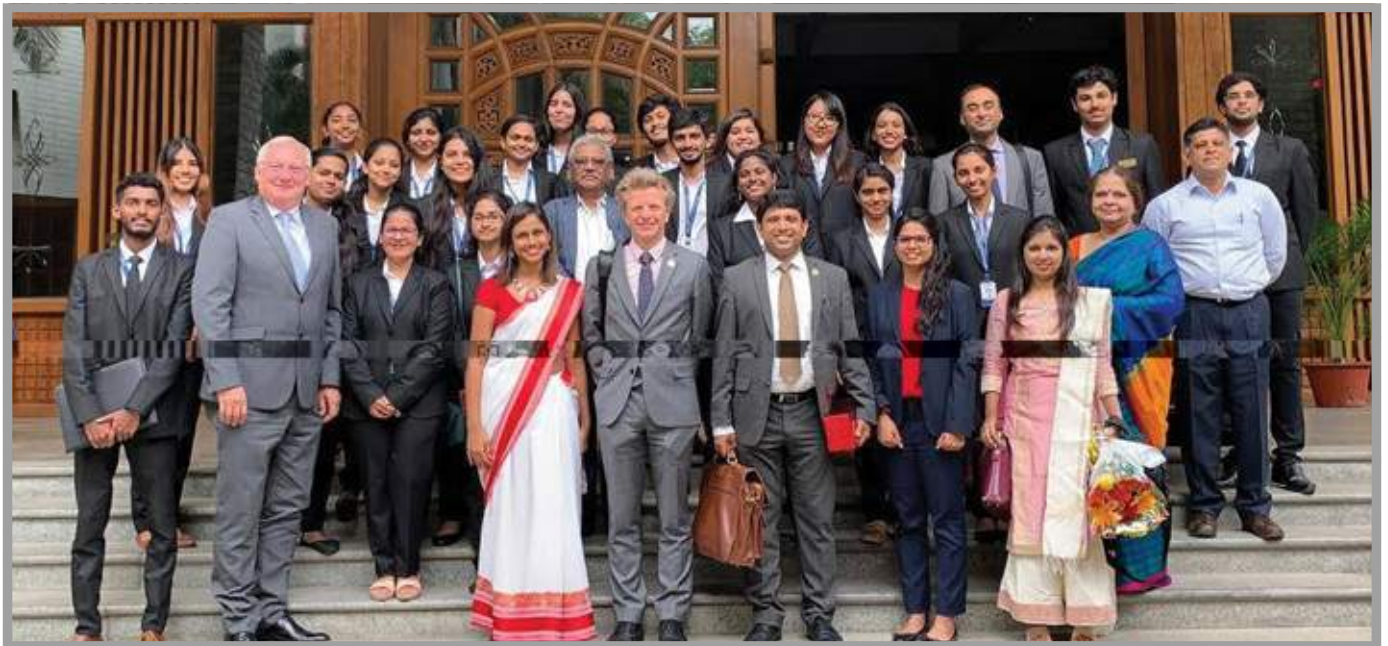
DIGNITARIES AT THE FIRMA CONCLAVE