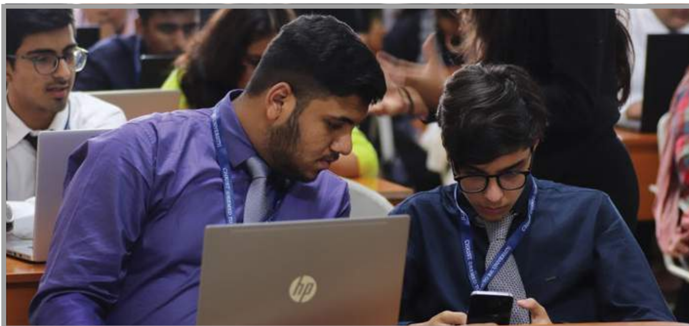
Participants - Insight 2019