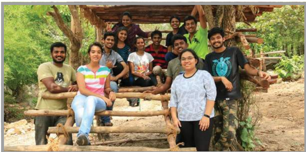
Visit to Wildlife SOS Bear Rescue Centre, Bannerghatta

As a token of appreciation to the parents who attended Confluence 2019 with their children, SAFE club members took the initiative to give a plant or a seed packet to all the parents who came for the event.