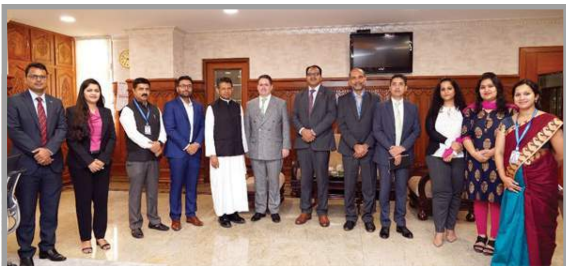
Photos of Meeting with Pro Vice Chancellor