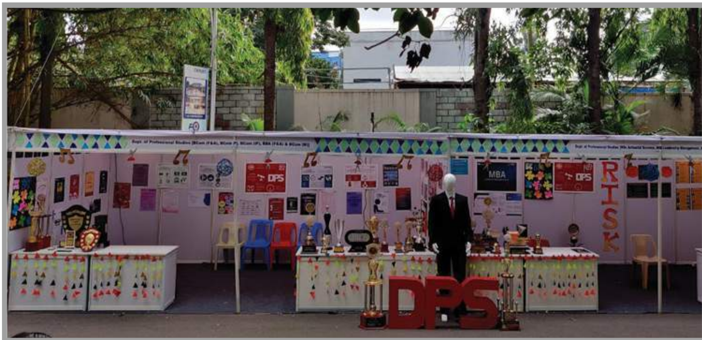
Stall Set up By Department of Professional Studies- Daksh 2019