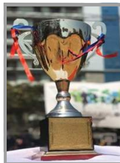
The overall champions trophy awarded to 2nd and 1st year Bcom F