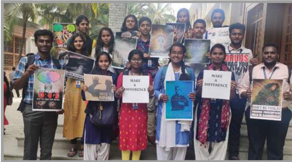
Drug Abuse Awareness Campaign