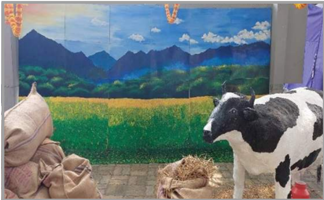
2nd Place, Theme Portrayal - Village (Blossoms 2020)