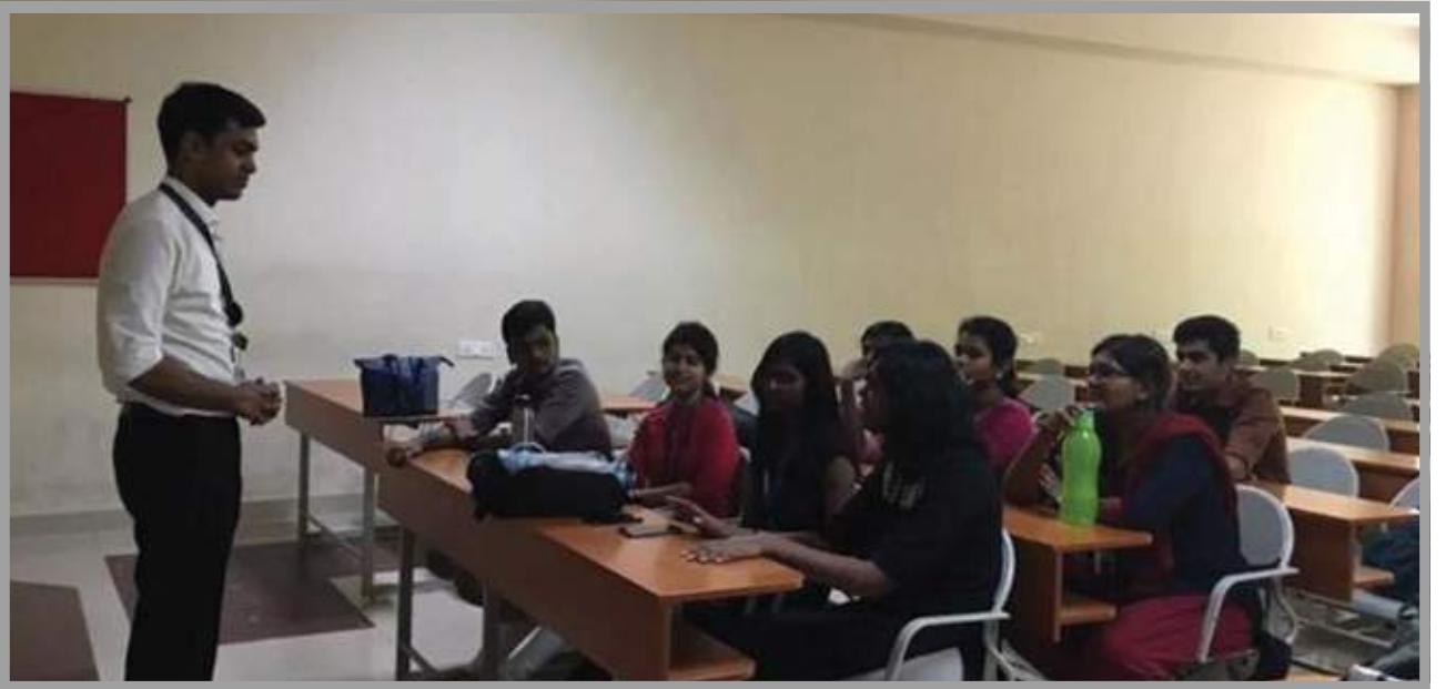
Kannada Nudi Team

In the last few classes, the Kannada Nudi team aims to teach students how to read letters as well as provide an overall sense of the Kannada Language.