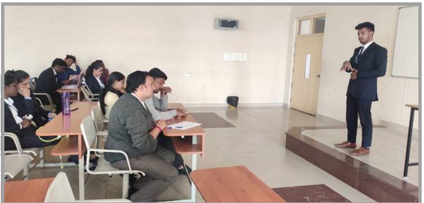
Topic Presentation-Turn Coat