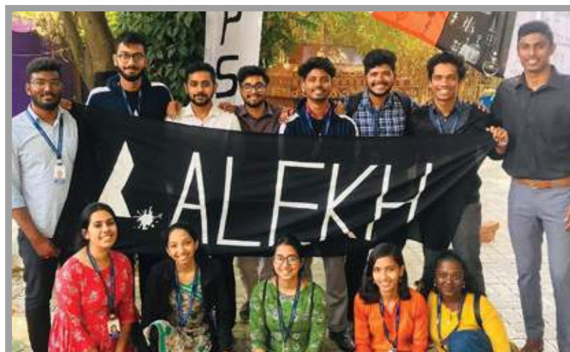
Team Alekh - Blossoms 2020