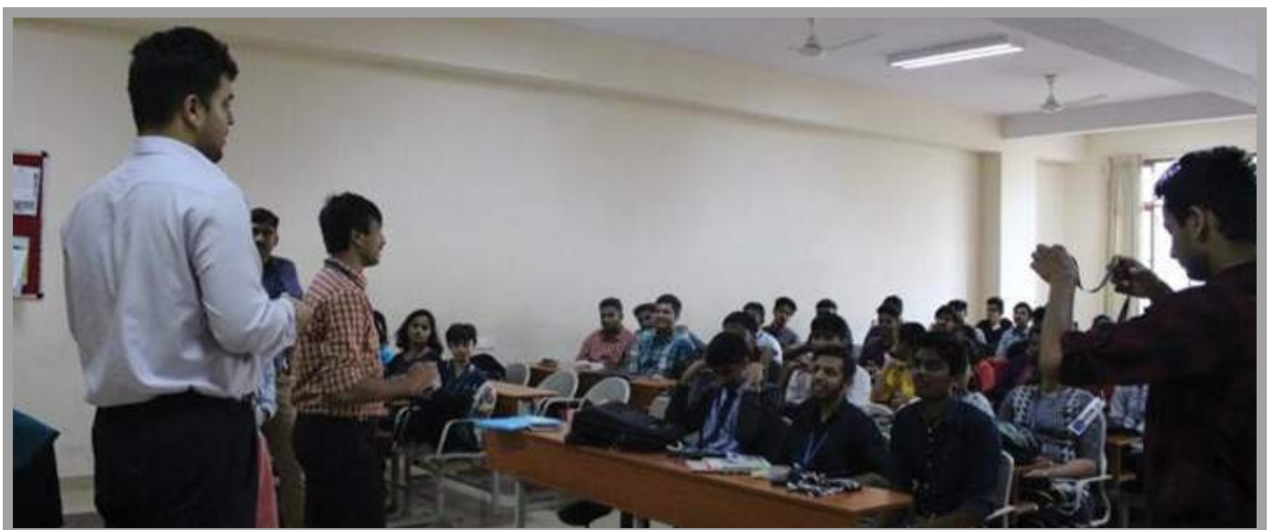
Trainers engaging the sessions with students