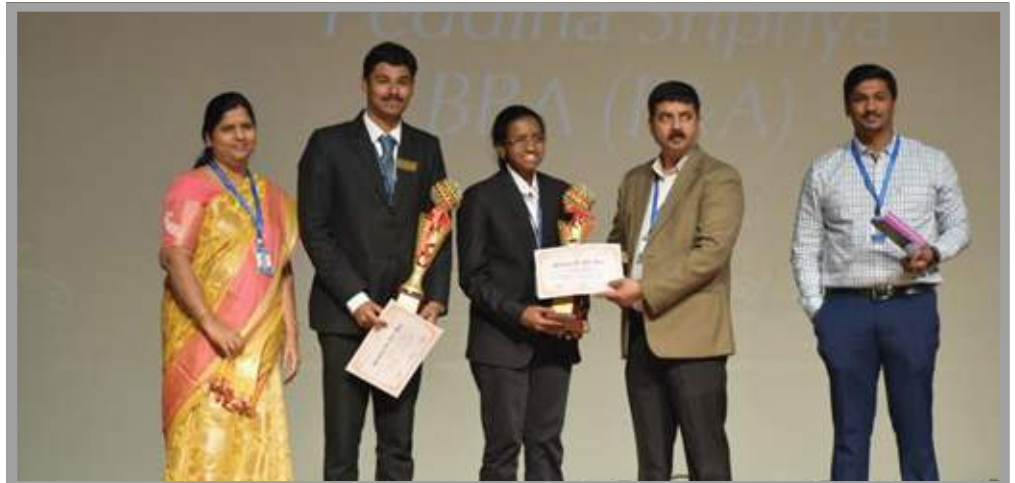
Student of the Year