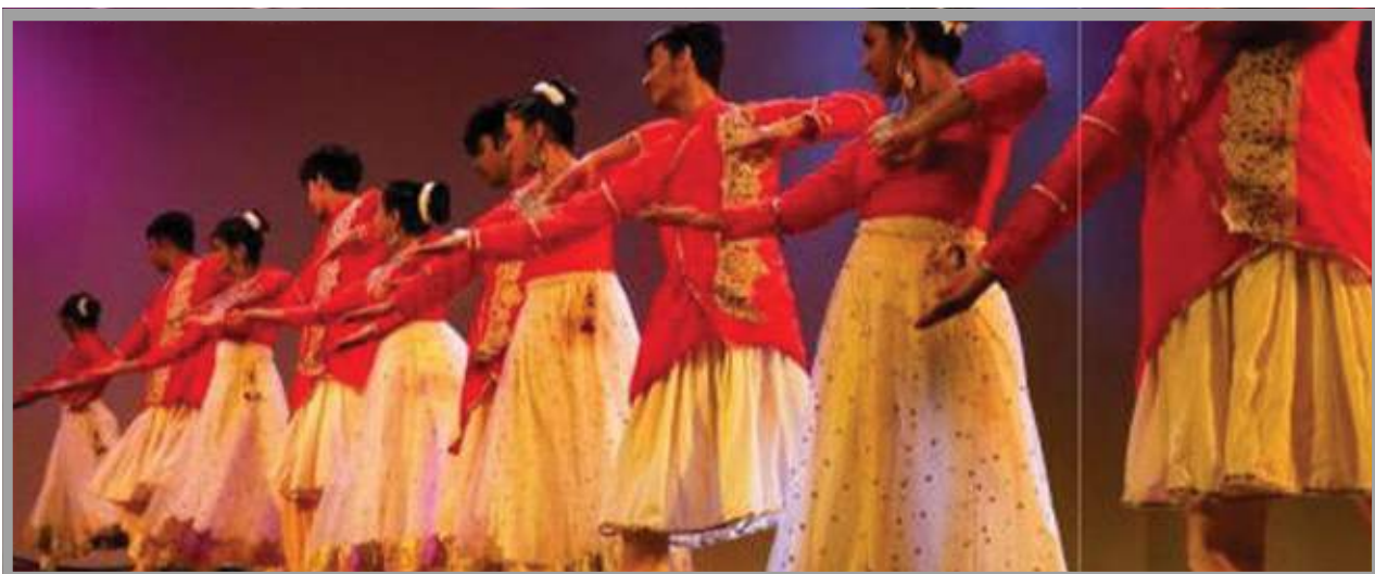
DANCE - TEAM DAKSH