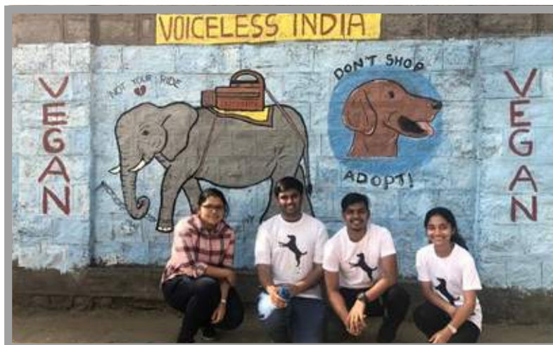
Wall painting done outside Lal Bagh

message of Compassion towards Animals, Sterilization Drives for Stray Dogs, Plantation Drives, Cleanliness Drives and several more projects to drive the people to raise their Voice for the Voiceless.