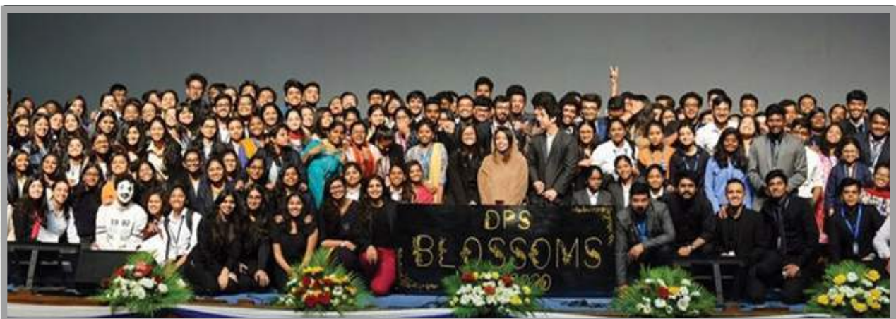
Winners of DPS blossoms