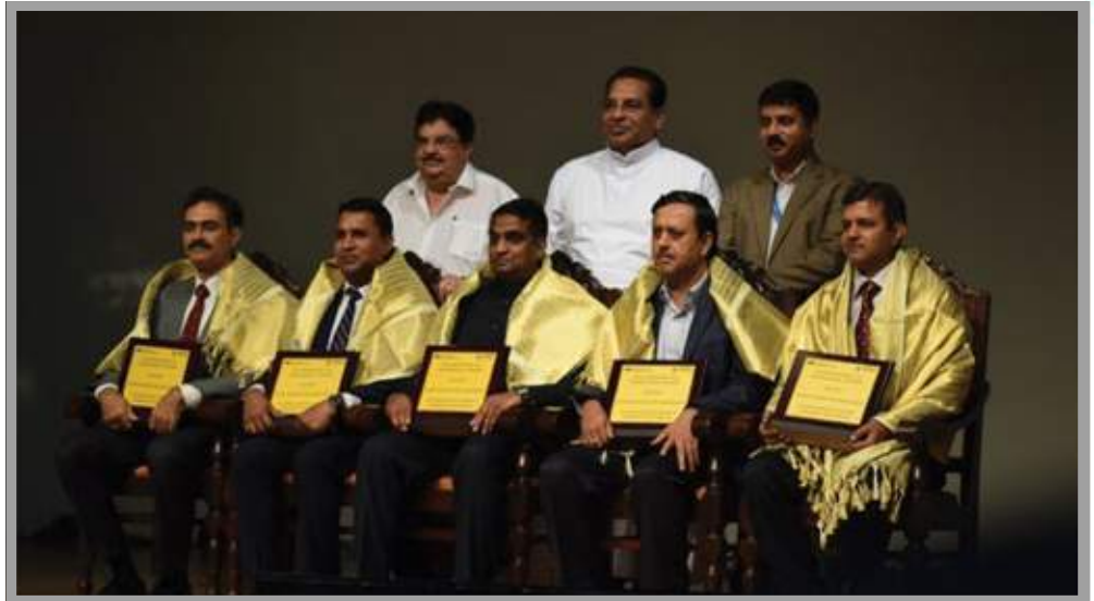
Parents serving in the armed force