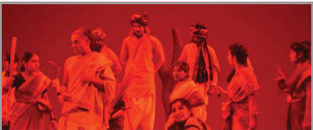
PROSCENIUM - TEAM KRANTI