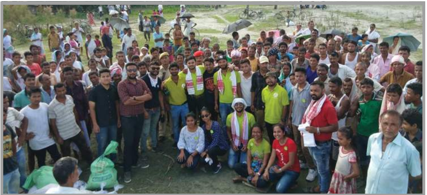
Volunteers for distribution of relief material