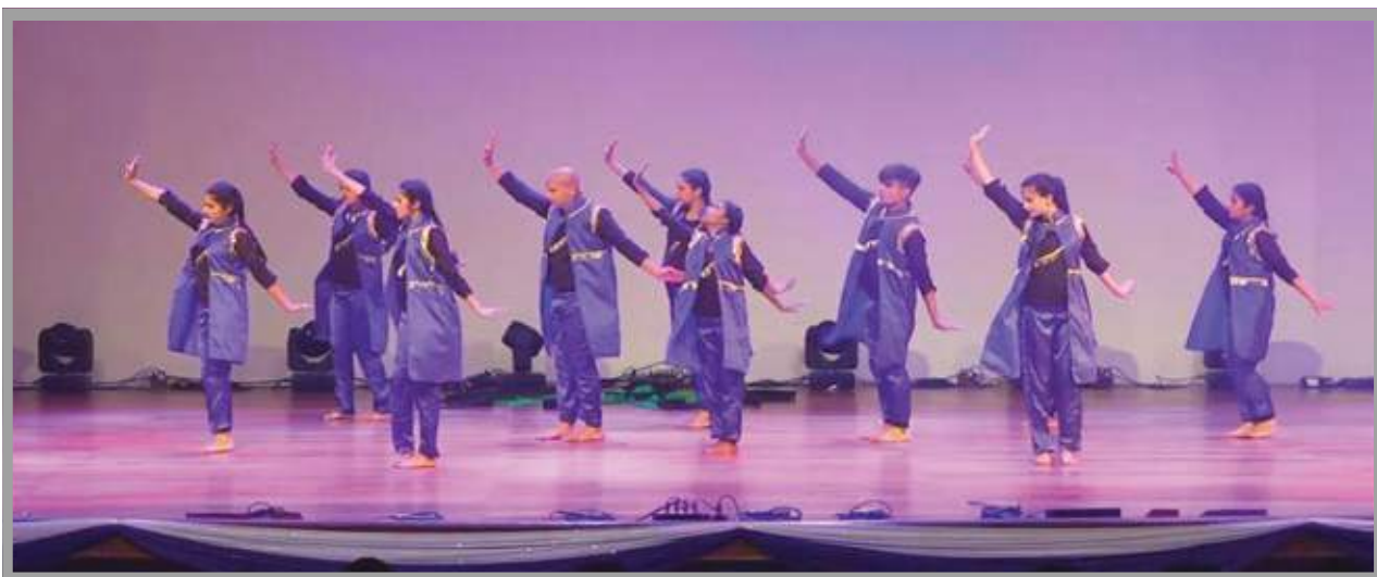
DANCE - TEAM MAAYA