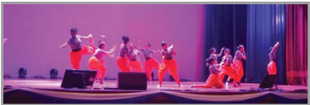
Dance Performance- Team Kanavu

At the end of the program, all the Teachers were given a sapling, a coffee mug and a snack box as a token of gratitude.