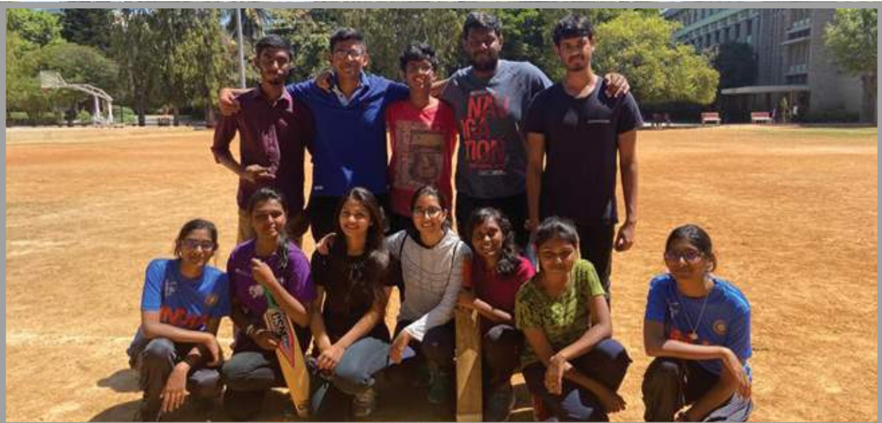
Runners up of Cricket 4 BCom F&A