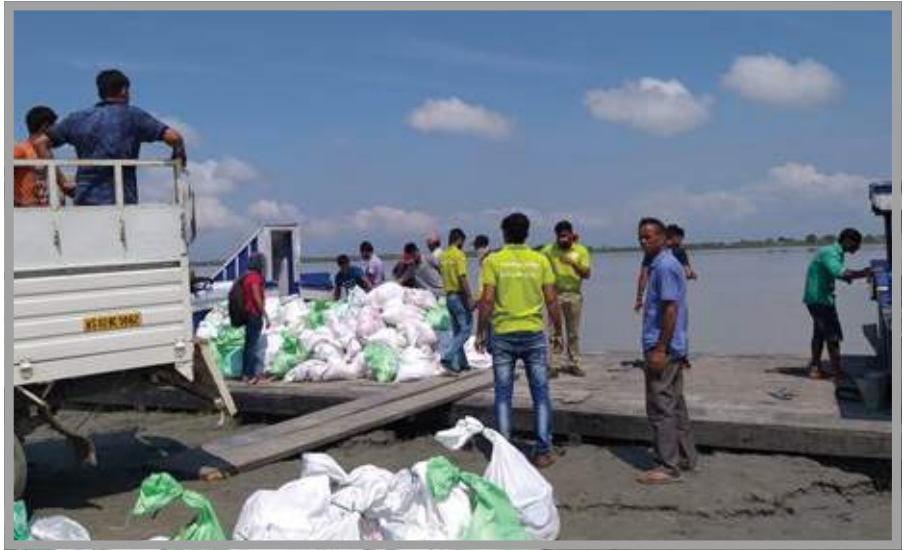
Relief material transported to flood affected areas

At this hour of need the students of the Department of Professional studies stepped up to do their part in providing relief.