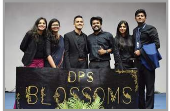
Faculty and student in charge for DPS blossoms