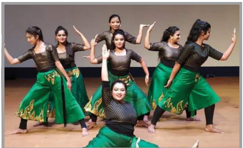
Dance performance by BCom Morning students