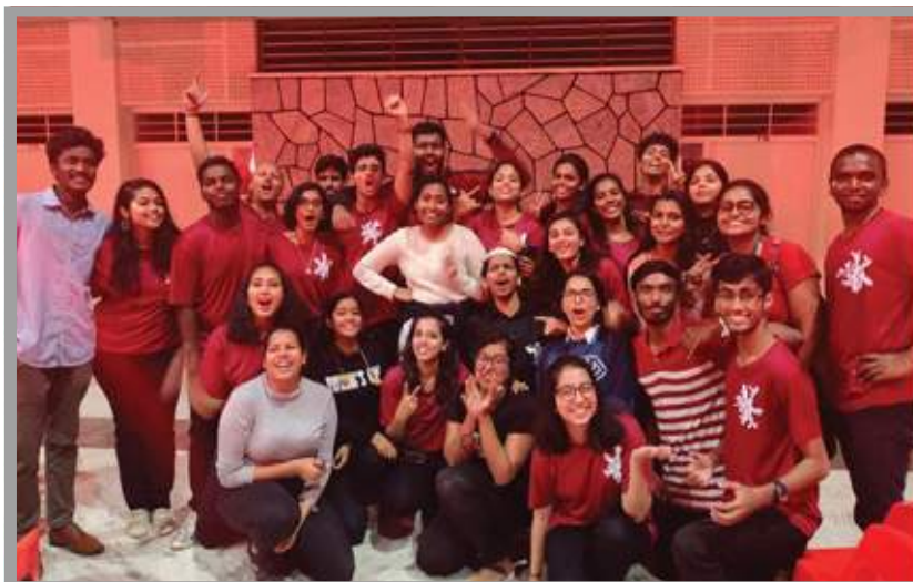
2nd Year BCom F&A