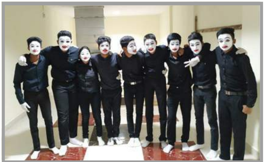
Mime team of BCom Morning